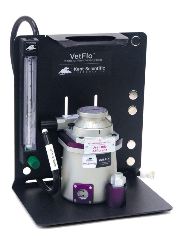
VetFlo vaporizer with single channel anesthesia stand