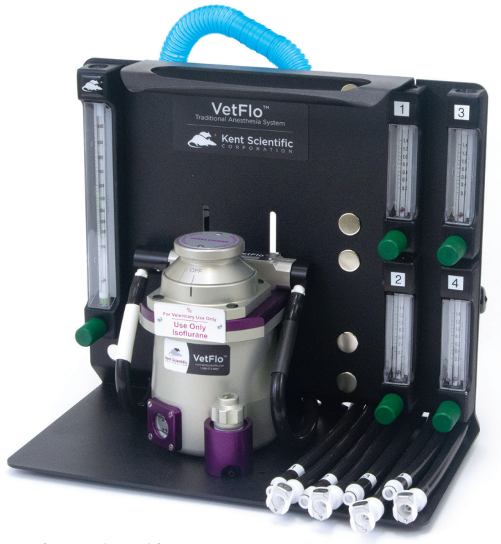
VetFlo vaporizer with four channel anesthesia stand