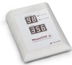
MouseSTAT Jr. Controller and power supply